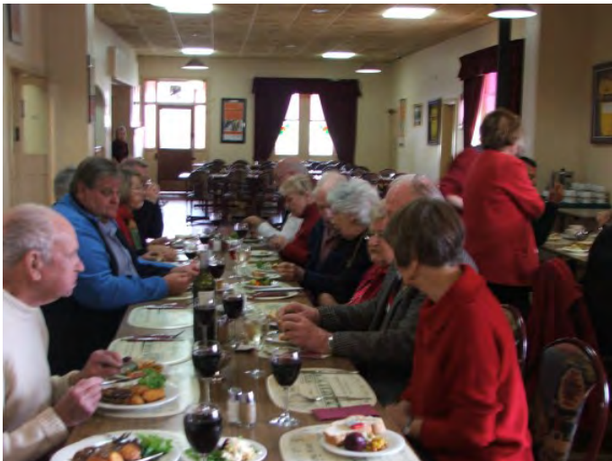
Lunch at the Alma Hotel after the Pentecost service at St Stephen's