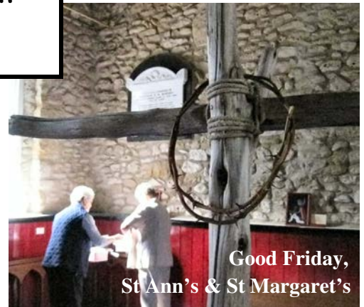
Good Friday, St Ann's & St Margaret's