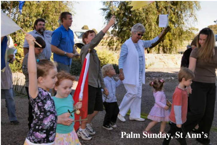
Palm Sunday, St Ann's

Newsletter of the Pastoral District of Southern Vales, Diocese of The Murray, SA