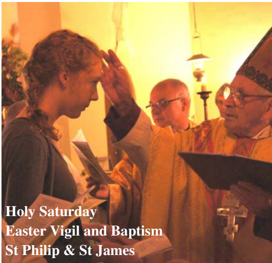
Holy Saturday Easter Vigil and Baptism St Philip & St James