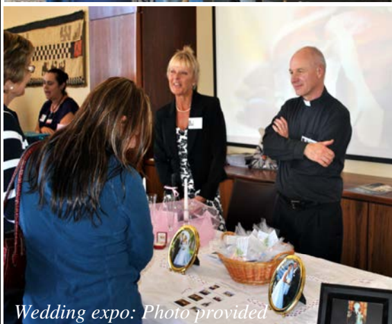
Wedding expo: Photo provided

Our driveway has been upgraded and is now greatly improved.