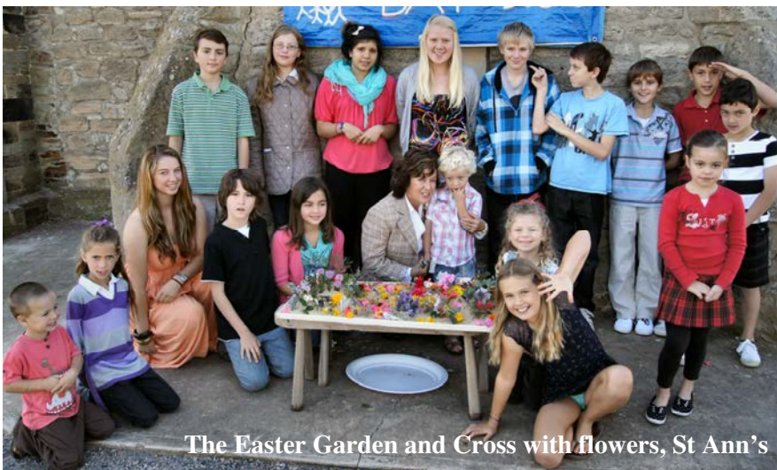
The Easter Garden and Cross with flowers, St Ann's