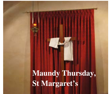
Maundy Thursday, St Margaret's

Highlights of Easter in the Southern Vales