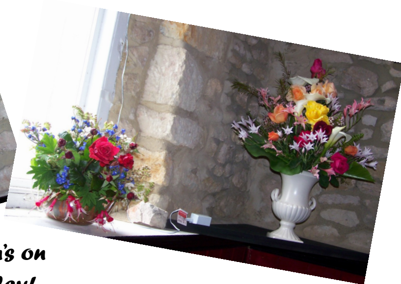
St Ann's on Display!