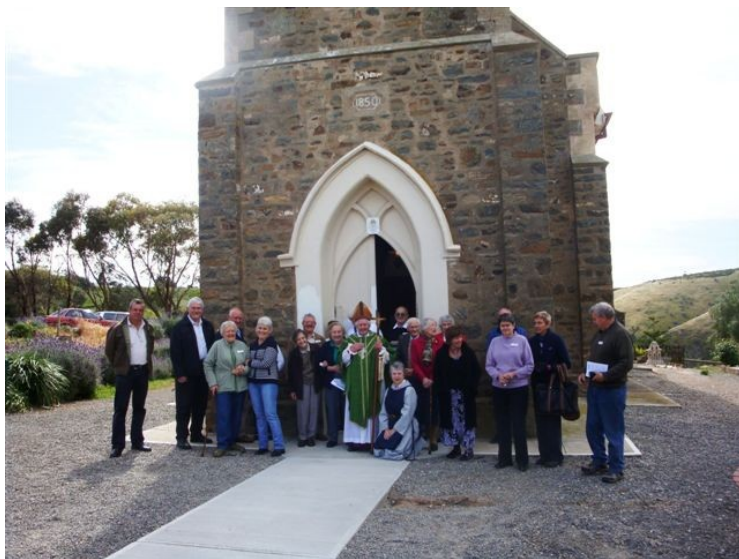
New path at SSPJ