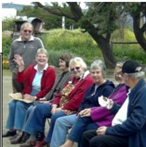
Enjoying the Wodgers :