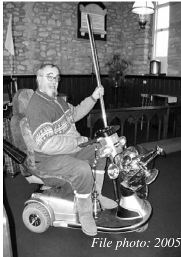
File photo: 2005