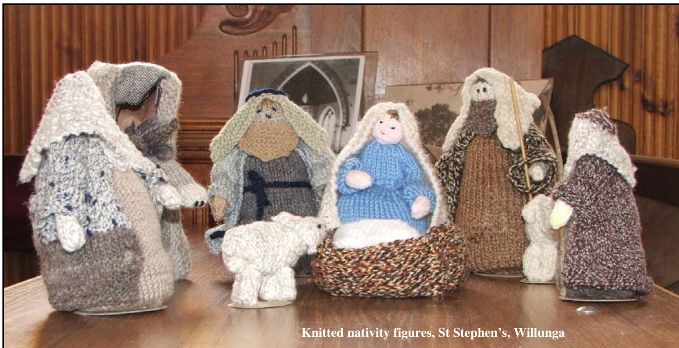
Knitted nativity figures, St Stephen's, Willunga

Newsletter of the Pastoral District of Southern Vales, Diocese of The Murray, SA