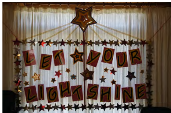
The banner which was made to carry in the Almond Blossom Parade