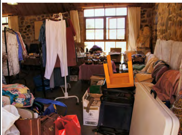
"Pre-Jumble jumble muddle" on Friday afternoon —no room for the Family Tea!

Looking for some chilled white wine to accompany your summer meals? Contact Fr Paul 8323 9744 to stock up your Verdelho or Riesling. There is still a little Shiraz available as well.