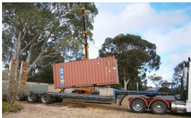
The container in the corner of St Margaret's land has finally found another resting place. With the aid of a fork lift and low loader it has moved to Sylvan Springs Estate at Blewitt Springs for further storage for the time being.