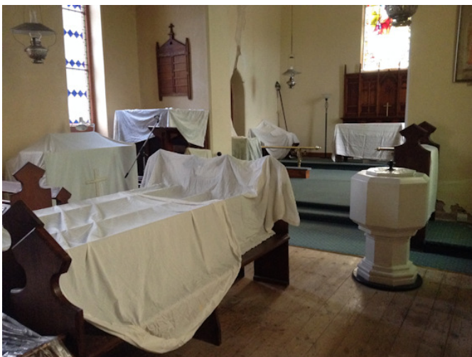
Covered for protection..