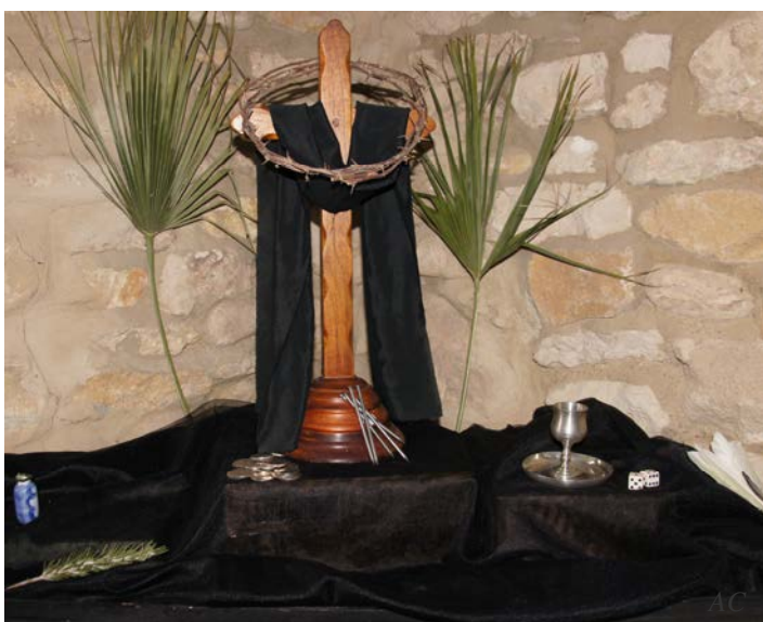
(R and below L) Easter Vigil at St Philip & St James, with the service beginning by candlelight. At the singing of the Gloria the church bell is rung, the cross uncovered and the church lights come on.