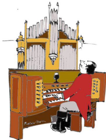
Friends of the Greg Trott Pipe Organ Assoc. Inc.

in St Margaret's Church, McLaren Vale. The church is too small to accommodate the pipes, but the console has been re-wired, computerised and amplified to operate as a "virtual" pipe organ.