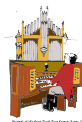
Friends of the Greg Trott Pipe Organ Assoc. Inc.

A Friends of the Greg Trott Pipe Organ fundraiser (see p. 10).