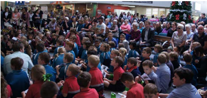
Photos: The cast, the crowd and R: Southern Vales Christian Collage children first sight the cupcakes.

This annual event is supported by volunteers from the six local churches working together, as well as local businesses and organisations, and is a wonderful opportunity to take the Christian Christmas message to the community.