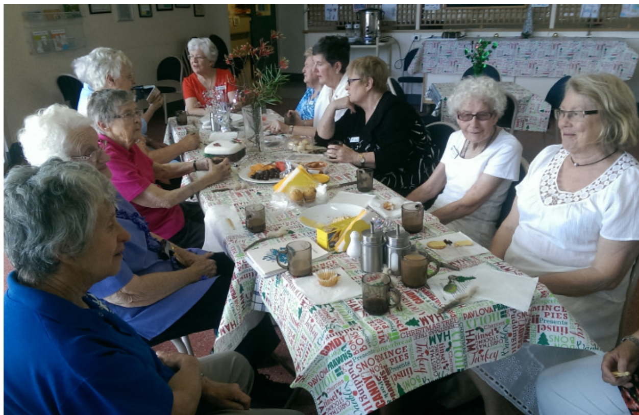
Mothers' Union Luncheon—another view (see p. 6)