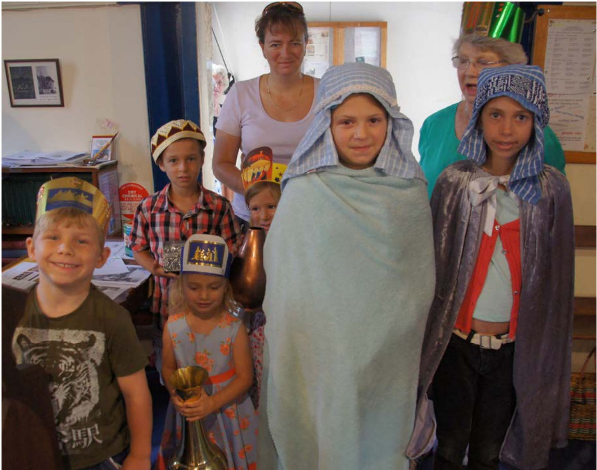
Epiphany—The Magi (see p. 8)