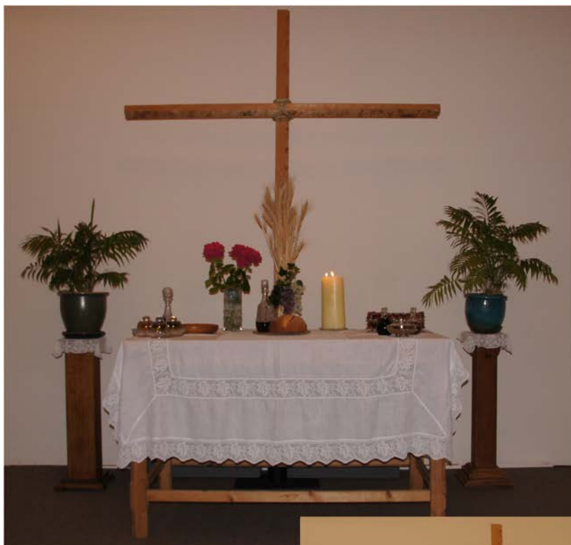
Ecumenical service Seaford Ecumenical Mission