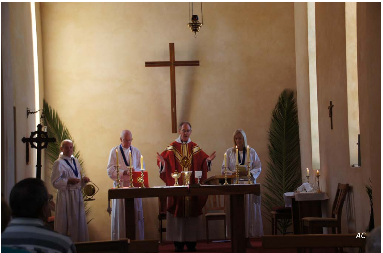
Below: The Palm Sunday service at St Margaret's. The red curtain had been removed.