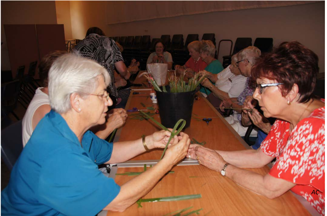
Above: Making Palm crosses at Seaford Ecumenical Mission: helping each other learn!