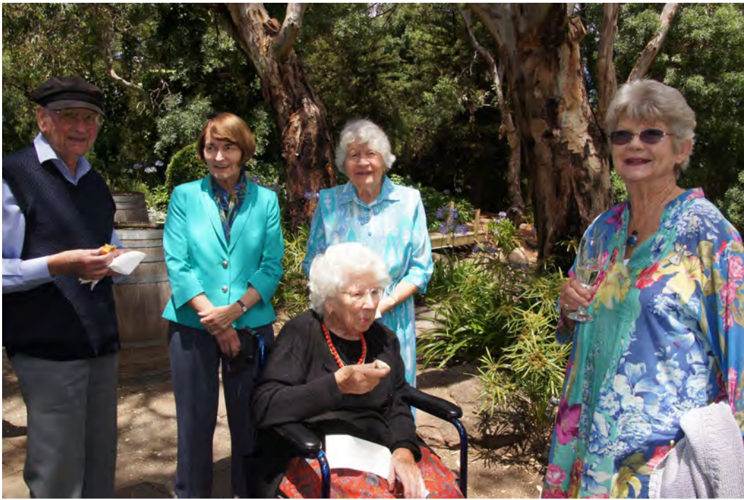
Pastoral District Christmas Luncheon at the Peacock Farm