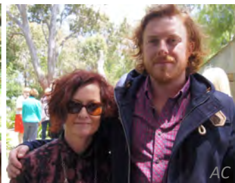
Pastoral District Christmas Lunch at the Peacock Farm