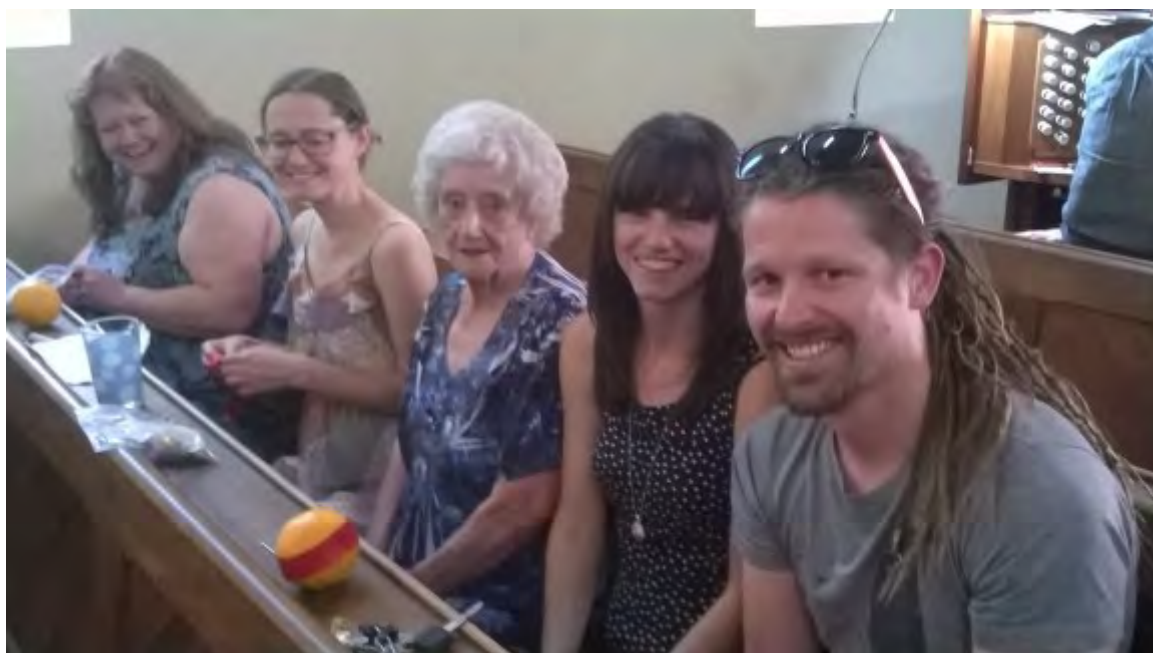
Children's service, St Margaret's, Christmas Eve