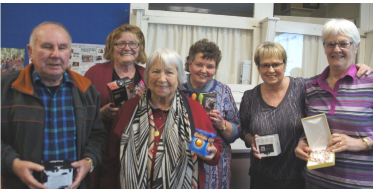
A knowledgeable SEM group won the prize at the Quiz Night!

We had a lighting problem in the church and it was found to be a short circuit in one of the fluorescent light fittings. It has been fixed.