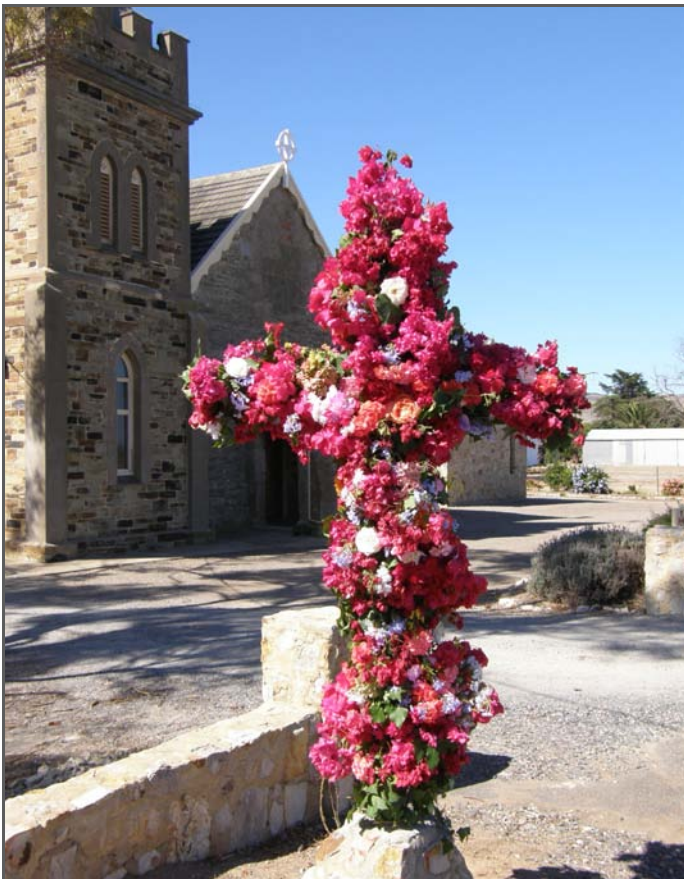
The Easter cross, decorated with flowers, celebrates the joy of the risen Christ (St Ann's, 2009).

Newsletter of the Pastoral District of Southern Vales, Diocese of The Murray, SA