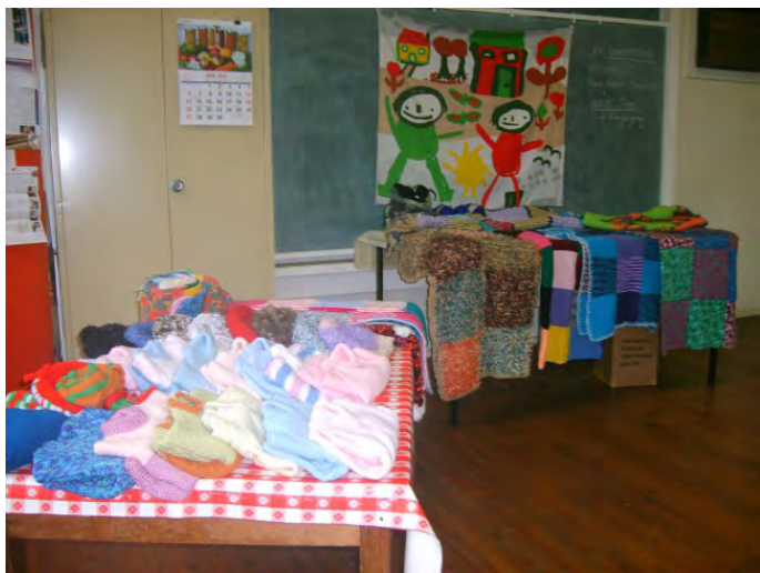
Display of rugs and clothes made by Women's Fellowship members.

Mother's Union and Women's Fellowship combined to learn the latest techniques used at Flinders Medical Centre Neonatal Unit. For a number of years the Fellowship has forwarded knitted items to Flinders Medical Centre Neonatal Unit.