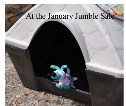
At the January Jumble Sale