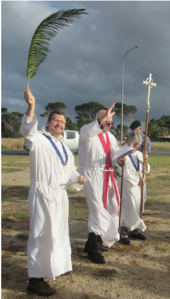
Palm Sunday, St Ann's