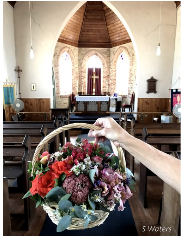
Flowers for Mothering Sunday (Saturday!) at St Stephen's.