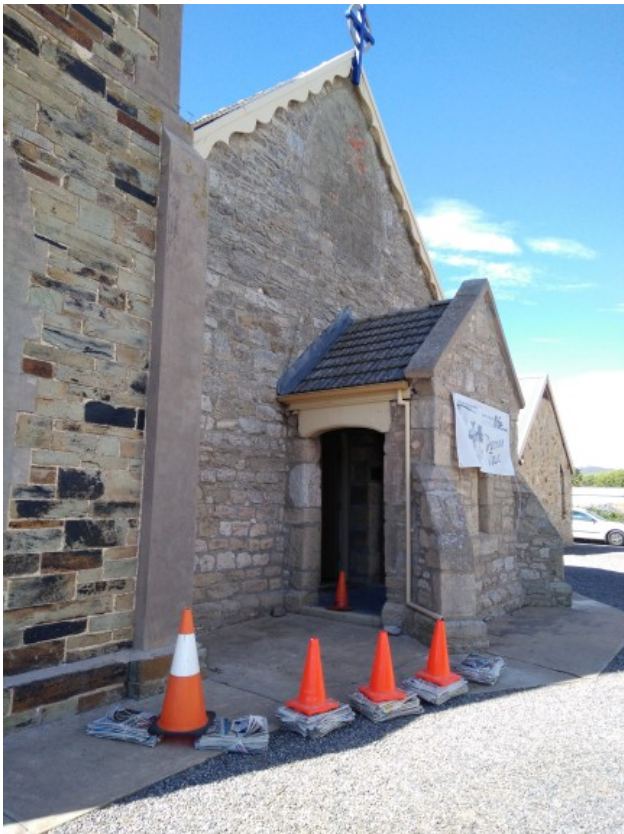
No entry here? There must be more to this?