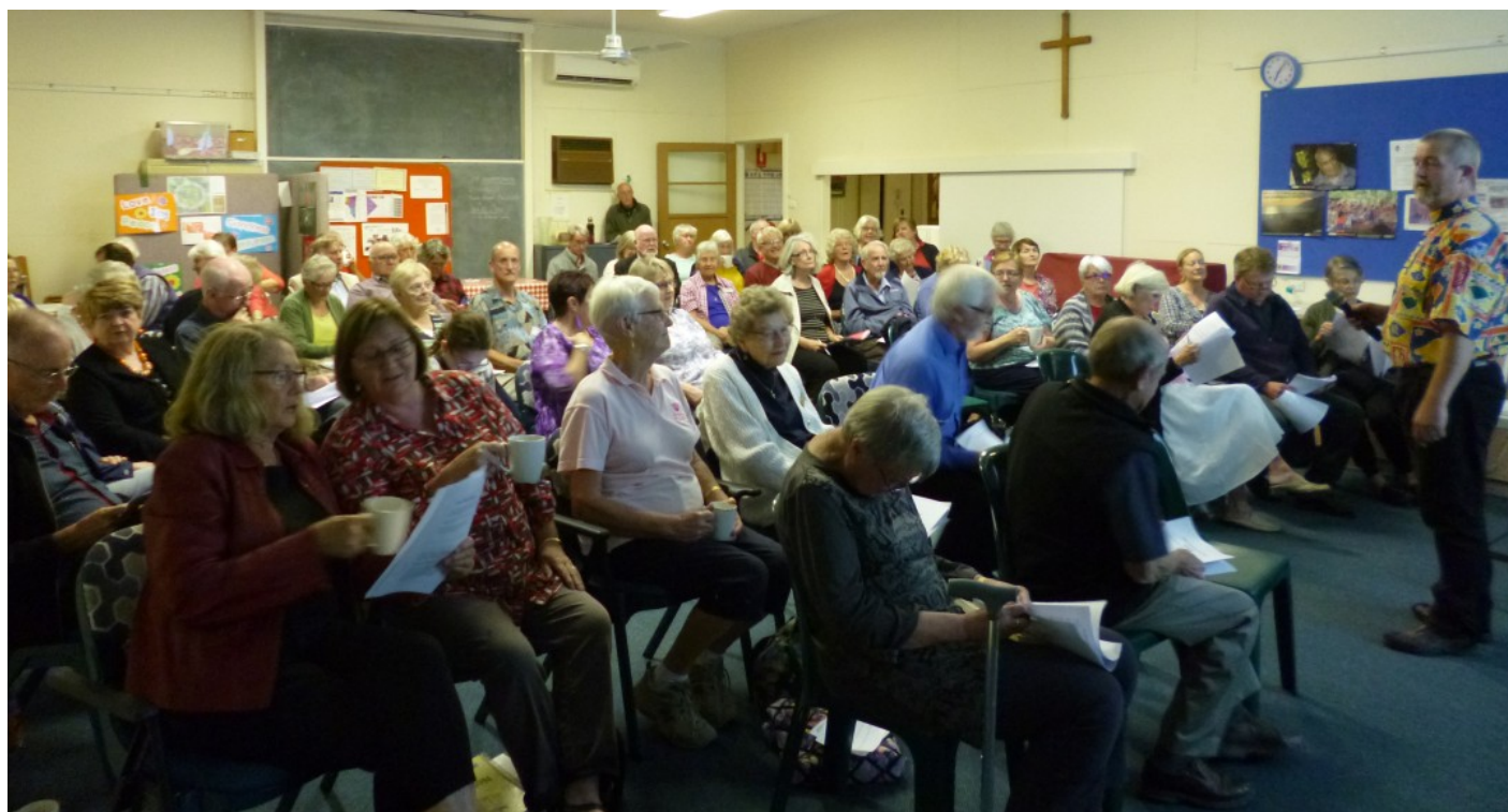
"The future of our church" - the meeting at St Margaret's on 3 rd April (see p. 2)