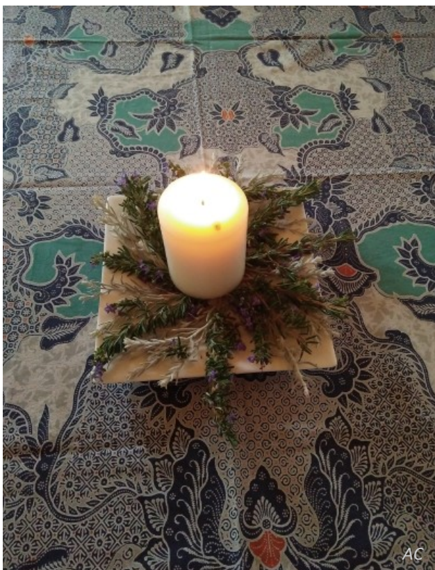
Prayers for Peace at St Ann's: an opportunity for shared prayer, reflection and meditation, and lighting a candle for peace.