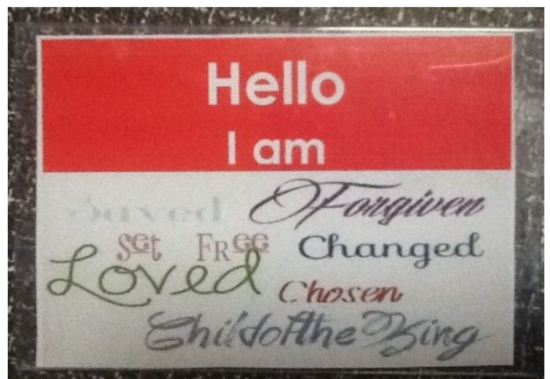
The name tag given to members of the congregation at the April Prayer, Praise & Proclamation service at St Margaret's.