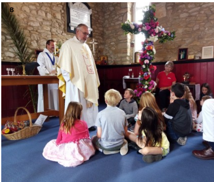
D: The Easter altar, St Nicholas, Seaford