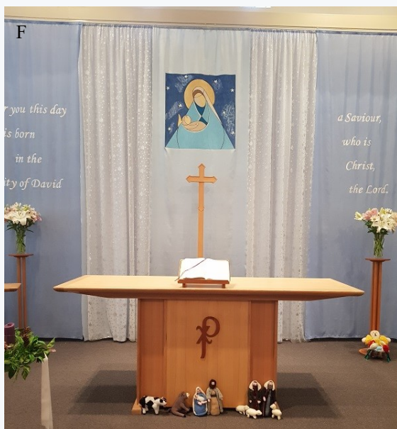
Outdoor Christmas services at (D) St Ann's and (E) Christ Church; Yankalilla. F: Ecumenical service at Seaford Christian Churches (see p. 6). G: at St James, Delamere (p. 9).