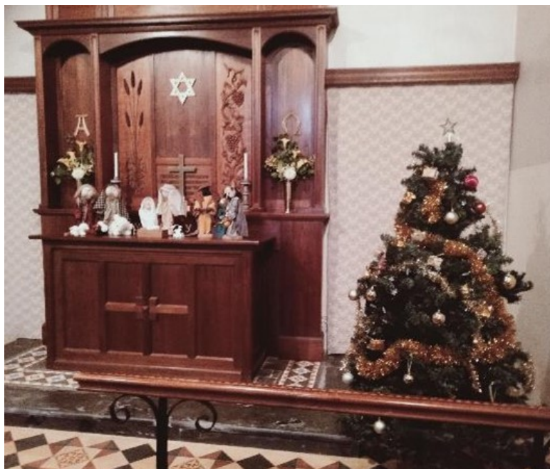
Christmas at Delamere and Yankalilla (see p. 9)