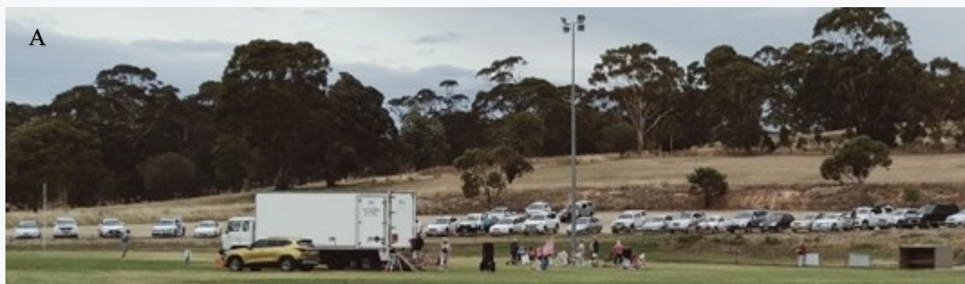
A: Carols in your car, Yankalilla (see p. 9)