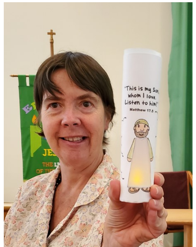
Jesus as our shining light—Sunara