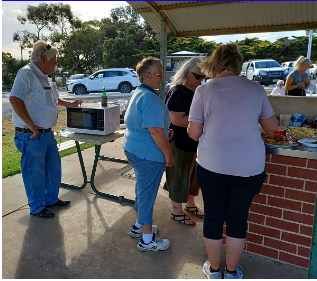
Cooking and enjoying pancakes in the park at Yankalilla (see p. 4)