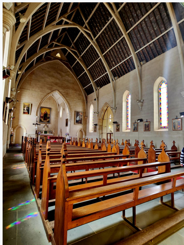
St Aloysius', Sevenhill