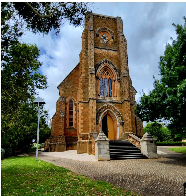
St Aloysius', Sevenhill, where the Diocesan Workshop was held (see pp. 8, 11)