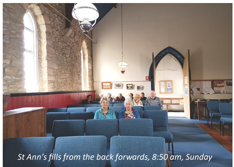
St Ann's fills from the back forwards, 8:50 am, Sunday

And if you think this (on the left) is just a cartoon, check out the photo on the right!