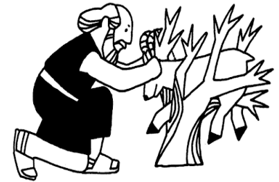
From The Complete Bible Story Clip Art Book.

far away. Then Abraham said to his young men, "Stay here with the donkey; the boy and I will go over there; we will worship, and then we will come back to you." Abraham took the wood of the burnt offering and laid it on his son Isaac, and he himself carried the fire and the knife. So the two of them walked on together. Isaac said to his father Abraham, "Father!" And he said, "Here I am, my son." He said, "The fire and the wood are here, but where is the lamb for a burnt offering?" Abraham said, "God himself will provide the lamb for a burnt offering, my son." So the two of them walked on together. When they came to the place that God had shown him, Abraham built an altar there and laid the wood in order. He bound his son Isaac, and laid him on the altar, on top of the wood. Then Abraham reached out his hand and took the knife to kill his son. But the angel of the Lord called to him from heaven, and said, "Abraham, Abraham!" And he said, "Here I am." He said, "Do not lay your hand on the boy or do anything to him; for now I know that you fear God, since you have not withheld your son, your only son, from me." And Abraham looked up and saw a ram, caught in a thicket by its horns. Abraham went and took the ram and offered it up as a burnt offering instead of his son. So Abraham called that place "The Lord will provide"; as it is said to this day, "On the mount of the Lord it shall be provided."