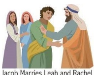
Jacob Marries Leah and Rachel

daughter Rachel.' Laban said, 'It is better that I give her to you than that I should give her to any other man; stay with me.' So Jacob served seven years for Rachel, and they seemed to him but a few days because of the love he had for her. Then