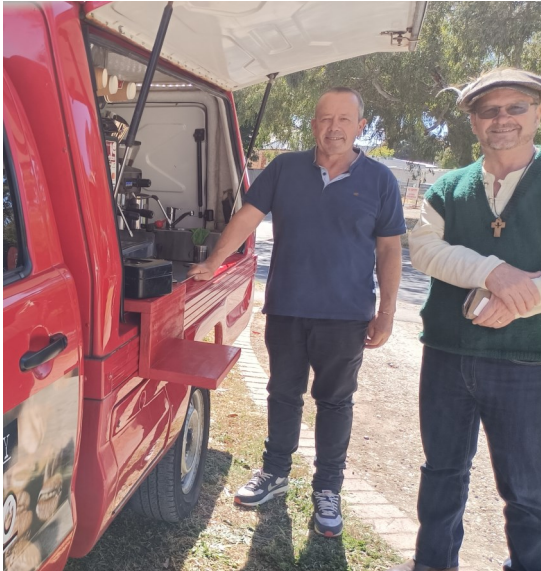
Dougy's coffee—a lifesaver!