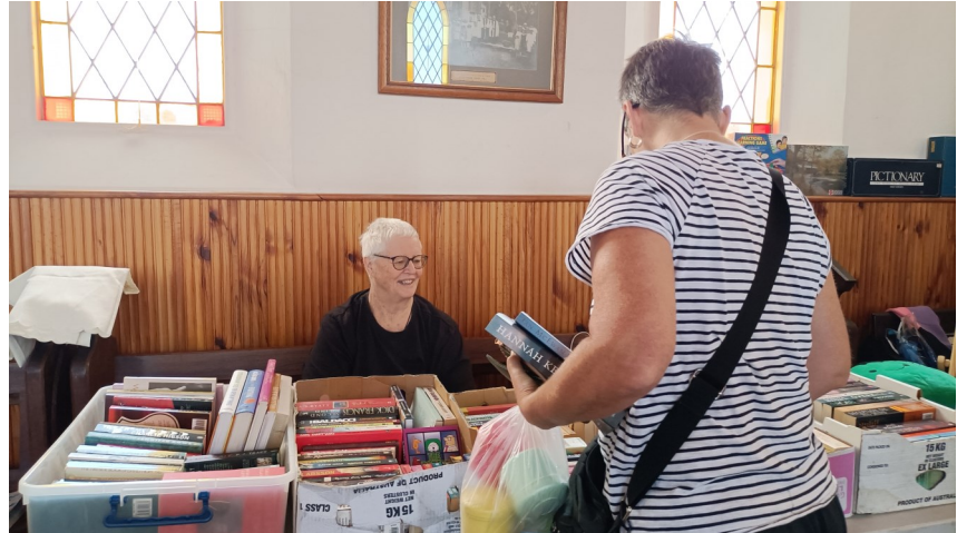
Pepper's books are always a favourite