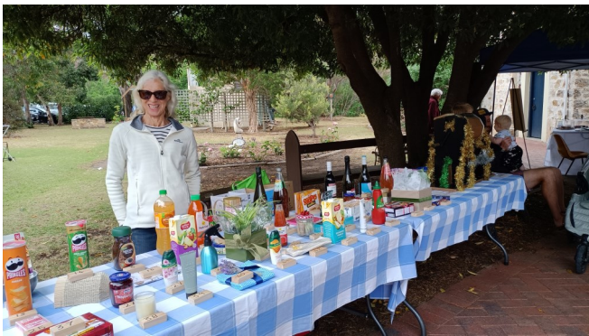
Some of the stalls and delights of the Strawberry Fete 2023