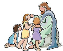
After taking them in His arms, He laid His hands on them and blessed them.

Some Pharisees came, and to test him they asked, "Is it lawful for a man to divorce his wife?" He answered them, "What did Moses command you?" They said, "Moses allowed a man to write a certificate of dismissal and to divorce her." But Jesus said to them, "Because of your hardness of heart he wrote this commandment for you. But from the beginning of creation, 'God made them male and female.' 'For this reason a man shall leave his father and mother and be joined to his wife, and the two shall become one flesh.' So they are no longer two, but one flesh. Therefore what God has joined together, let no one separate." Then in the house the disciples asked him again about this matter. He said to them, "Whoever divorces his wife and marries another commits adultery against her; and if she divorces her husband and marries another, she commits adultery." People were bringing little children to him in order that he might touch them; and the disciples spoke sternly to them. But when Jesus saw this, he was indignant and said to them, "Let the little children come to me; do not stop them; for it is to such as these that the kingdom of God belongs. Truly I tell you, whoever does not receive the kingdom of God as a little child will never enter it." And he took them up in his arms, laid his hands on them, and blessed them.