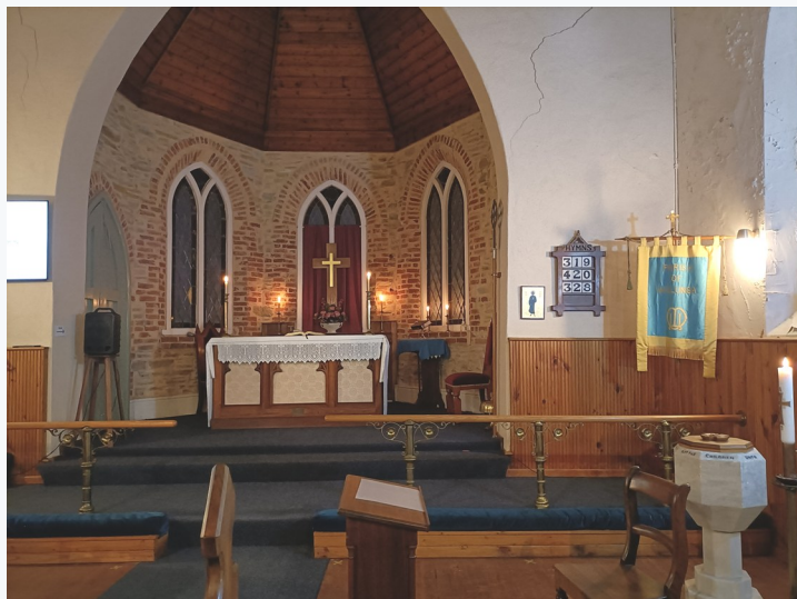
The softer light in the sanctuary enhances its peace and beauty.