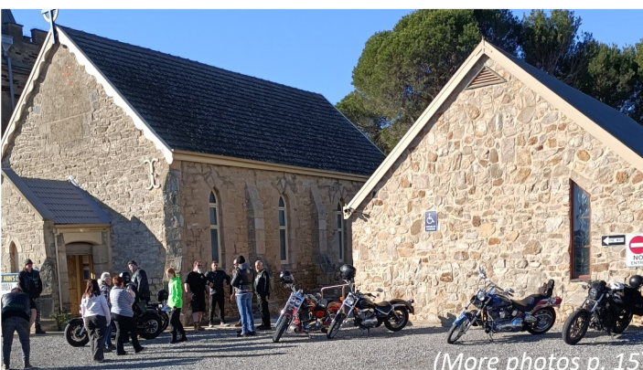
(More photos p. 15)

Read The Grapevine in colour, with additional pages of photos, on our parish website, southernvalesparish.org