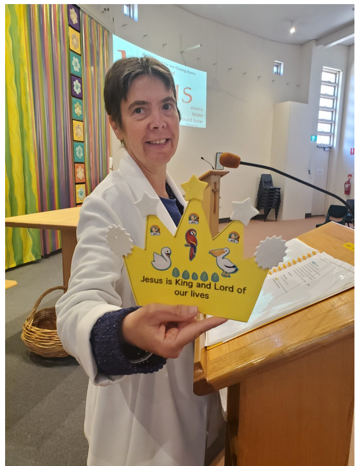
Sunara: Christ the king