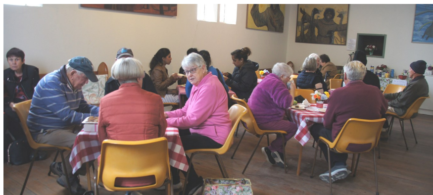
A cup of tea with scones, jam and cream: a highlight of the day.