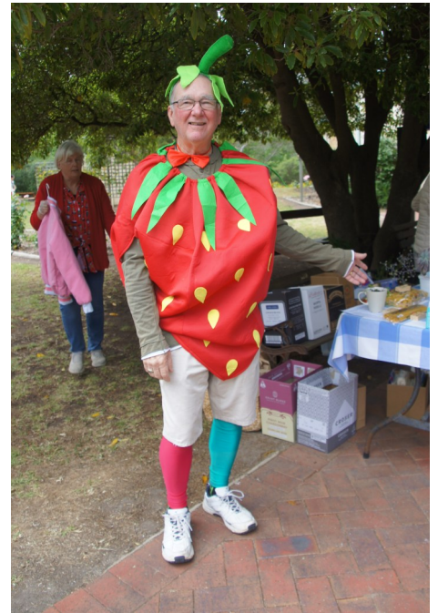
The Giant Strawberry made his much-anticipated annual appearance!