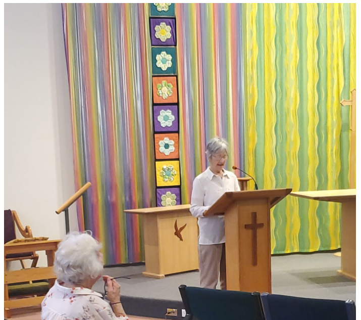
Georgia reading the Lesson