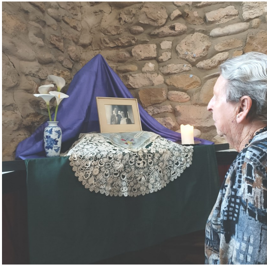
"Margaret's Corner" at St Ann's, reflecting the theme of the day: Remembrance Day (L) and Christ the King (R).