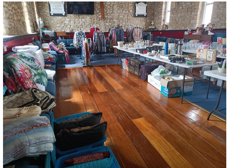
Jumble Sale: setting up on Thursday 13 th