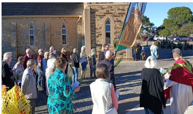
Gathering for the Palm Sunday procession.